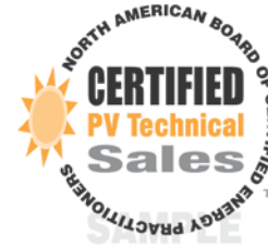
Jane Doe Certification #03142003-29