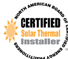
Jane Doe Certification #03142003-29